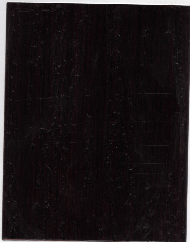
HYOU2-002F-M6 铜铝复合板 ( 木纹6 ) Copper-Alu ( Wood 6 )