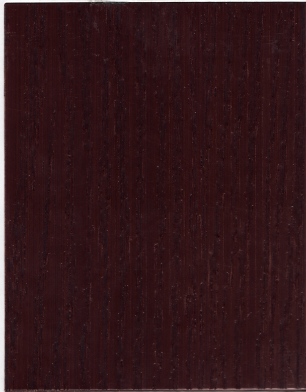
HYOU2-002F-M2 铜铝复合板 ( 木纹2 ) Copper-Alu ( Wood 2 )