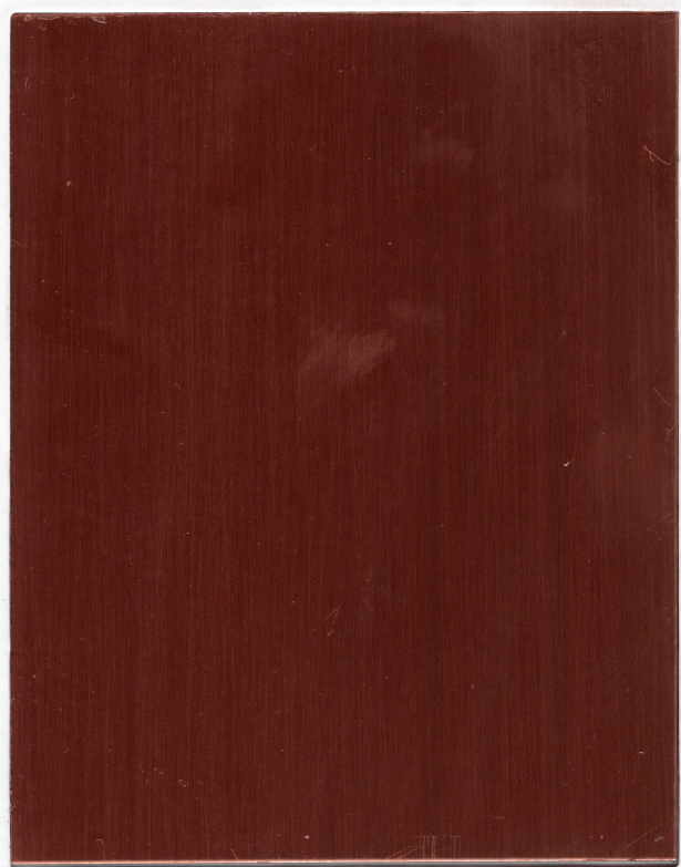
HYOU2-002F-01 铜铝复合板 ( 着浅古铜 ) Copper-Alu ( Bronze )