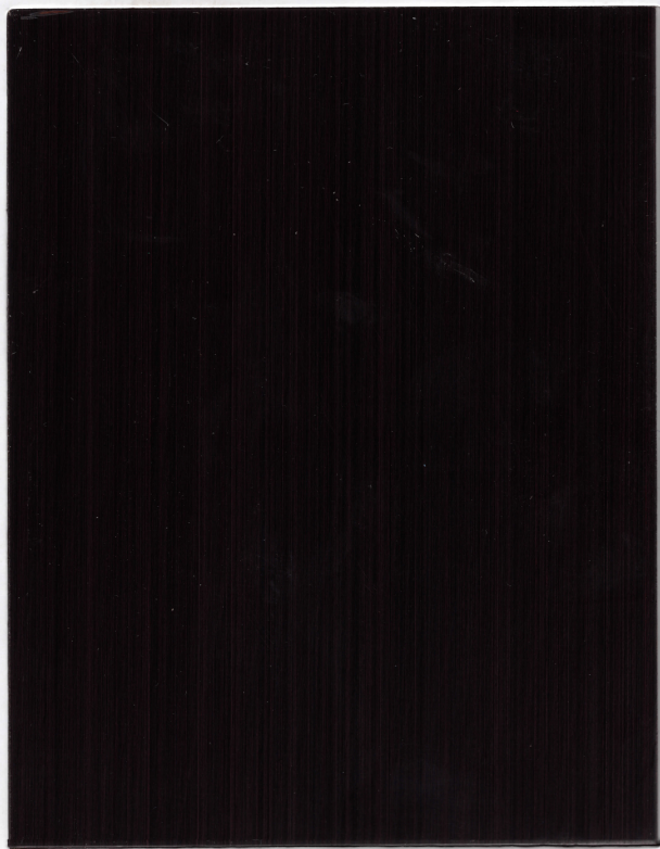
HYOU2-002F-M1 铜铝复合板 ( 木纹1 ) Copper-Alu ( Wood 1 )