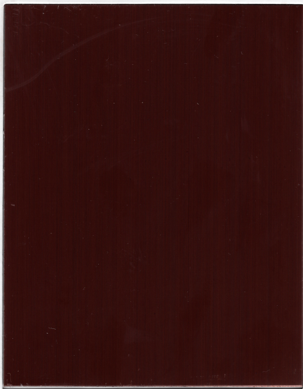
HYOU2-002F-03 铜铝复合板 ( 着深古铜 ) Copper-Alu ( Dark Bronze )