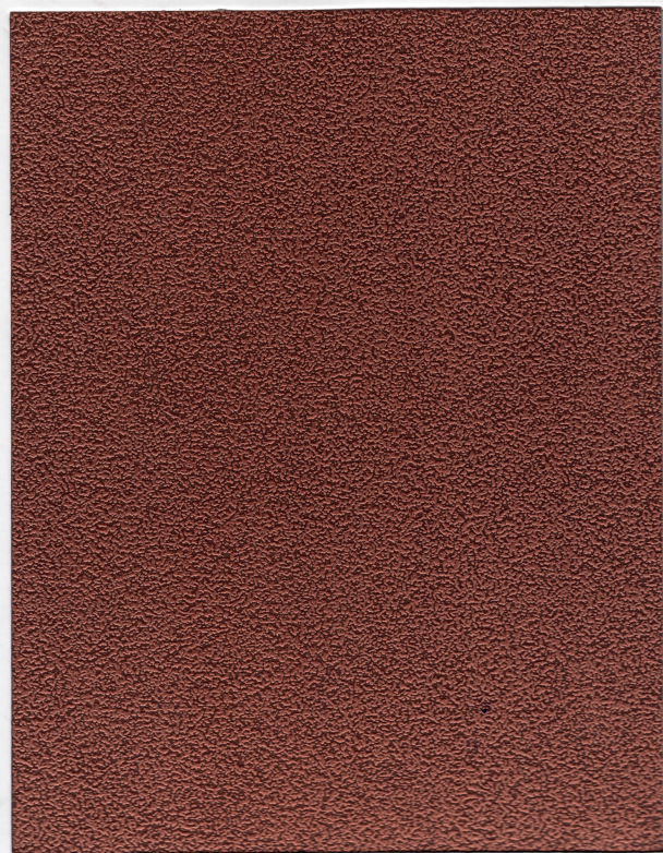
HYOU2-002F-M5 铜铝复合板 ( 木纹5 ) Copper-Alu ( Wood 5 )