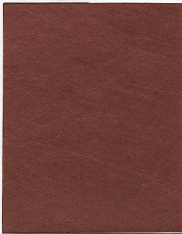
HYOU2-002F-10 铜铝复合板 ( 和纹 ) Copper-Alu ( Copper Crush )