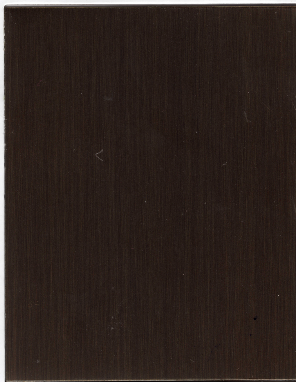
HYOU*2-002F-02 黄铜铝复合板 ( 着中青铜 ) Brass-Alu ( Bronze )