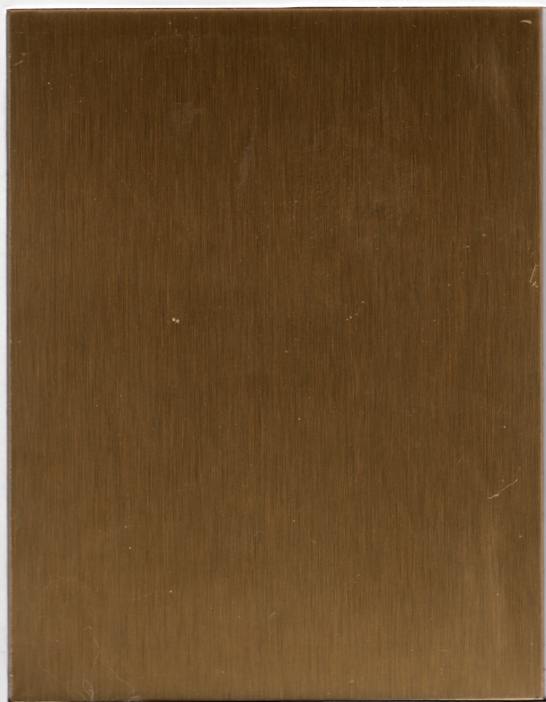
HYOU*2-002F-H2 黄铜铝复合板 ( 花纹2 ) Brass-Alu ( Pattern 2 )