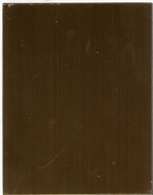
HYOU*2-002F-01 黄铜铝复合板 ( 着浅青铜 ) Brass-Alu ( Bronze )