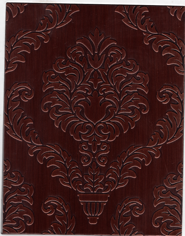
HYOU2-002F-H1 铜铝复合板 ( 花纹1 ) Copper-Alu ( Pattern1 )