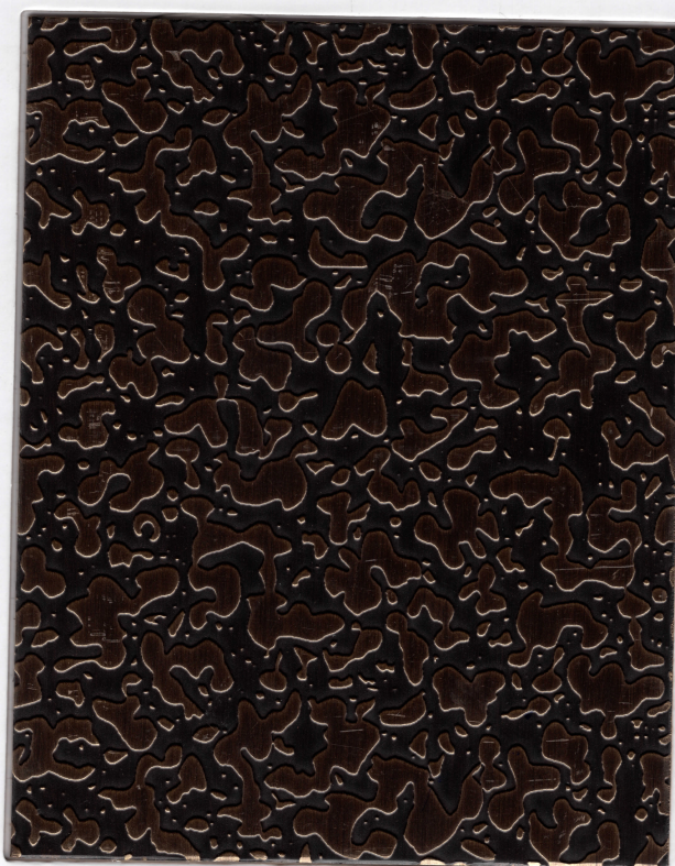
HYOU*2-002F-H3 黄铜铝复合板 ( 花纹3 ) Brass-Alu ( Pattern 3 )