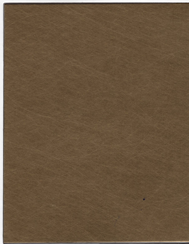
HYOU*2-002F-10 黄铜铝复合板 ( 和纹 ) Brass-Alu ( Brass Crush )