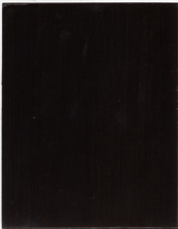
HYOU*2-002F-03 黄铜铝复合板 ( 着深青铜 ) Brass-Alu ( Dark Bronze )