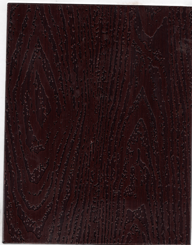
HYOU2-002F-M3 铜铝复合板 ( 木纹3 ) Copper-Alu ( Wood 3 )